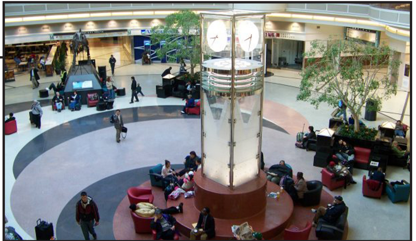
Clock tower in the Atrium