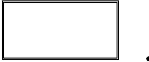
Figure 1.2: Some TikZ picture.